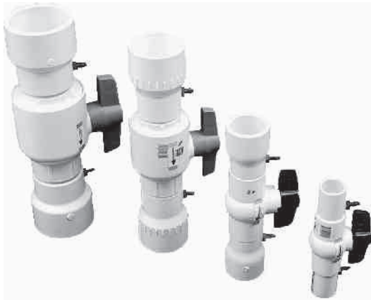
EZ Ball Valve Connections larger than 1" have a slight reduction that does not affect line pressure and flow

Ball valve coupling (CBV) connectors are available in sizes 3/4" through 2" with socket x socket connections. They are PVC schedule 40 with 1/4" nylon barbed tubing connectors. They are used to connect the EZ-FLO hose and drip systems to the irrigation flow line with the 1/4" flexible tubing provided with the EZ-FLO system. They provide the ability to adjust the differential pressure between the inlet and outlet connection to the irrigation system flow line.